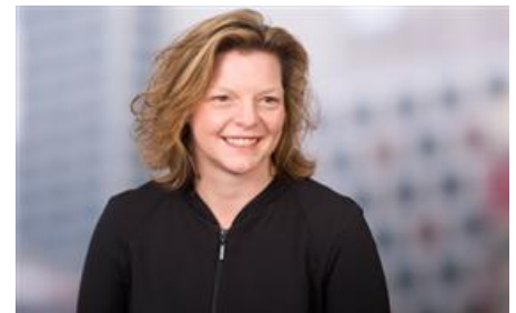
Meghan Speers Superannuation - Tax

The Government will also remove a redundant requirement for superannuation funds to obtain an actuarial certificate when calculating ECPI using the proportionate method, where all members of the fund are fully in the retirement phase for all of the income year.