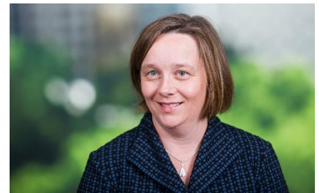
Colette Rogers Education and Training

This is intended to provide the "building blocks for long-term tertiary reform" and to ensure the tertiary sector supports the skills needs of students, industry and the economy. While the overall funding commitment is modest in the context Governments' aggregate outlays on VET, this is nevertheless a notable repositioning and enhanced focus of the Australian Government's role in supporting VET.