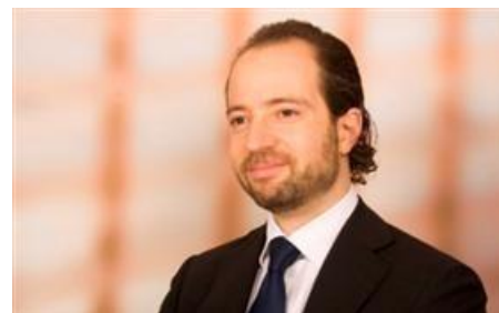
Claudio Cimetta International Tax

Currently the G20 and the OECD are exploring a multilateral response to the tax challenges presented by the digitalisation of the economy. On 20 March 2019, the Government announced that it had decided to continue to focus on engaging in a multilateral process and not to proceed with an interim measure, such as a digital services tax, at this time.